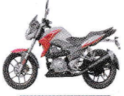
মডেল : Z One 150 cc